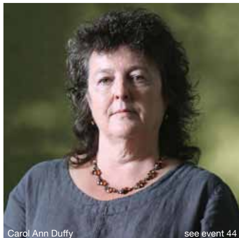
Carol Ann Duffy

The Eric Gregory Awards consistently identify promising young poets. Come and hear this year's winners.