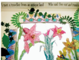
Poetry Paradise Garden